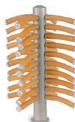
40 port manifold