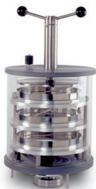
Large capacity stoppering chamber