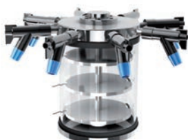
Standard chamber with 8 port manifold