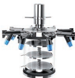
Standard stoppering chamber with 8 port manifold