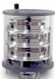
Large capacity chamber