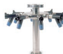
8 port manifold