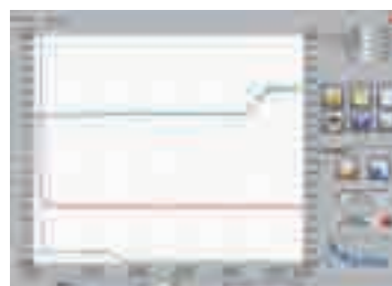
LyoLogger software screen