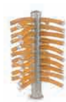
40 port manifold