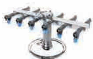
Stackable 12 port manifold with adaptor plate