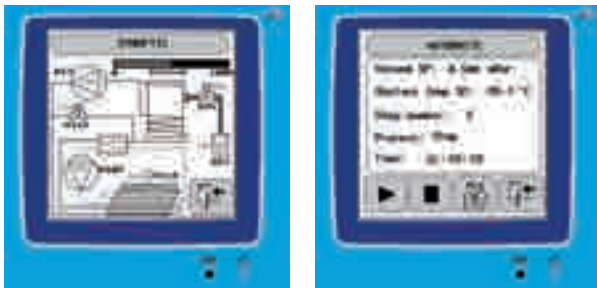
LyoAlfa 10/15 control panel screens

This model incorporates unique and high level control performances, as well as excellent technical features.