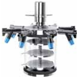
Standard stoppering chamber with 8 port manifold