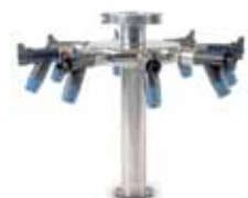
8 port manifold