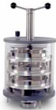
Large capacity stoppering chamber