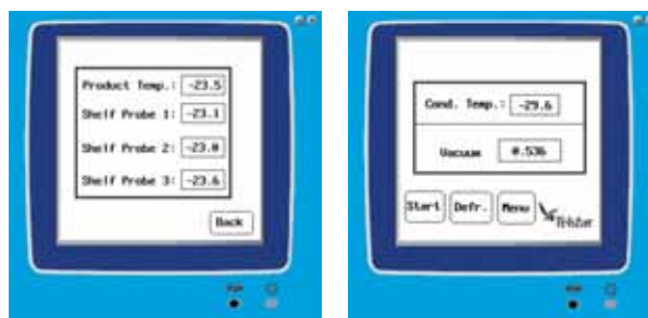
LyoQuest control panel screens

Based on more than 40 years of experience, Telstar introduces the LyoQuest as state of the art in performance and process control. The unit was specifically developed for basic research in biotechnology and scientific institutes.