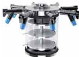
Standard chamber with 8 port manifold