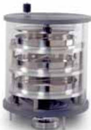
Large capacity chamber