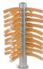
40 port manifold