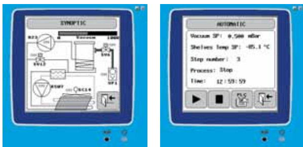
LyoAlfa 10/15 control panel screens

This model incorporates unique and high level control performances, as well as excellent technical features.