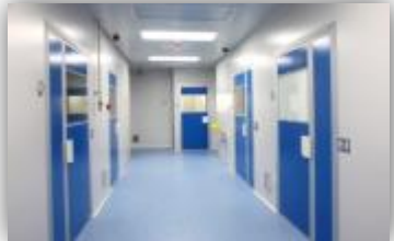
Clean Room systems