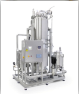
Process & Water