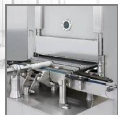
GMP freeze-dryers Loading and unloading systems (LyoGistics)